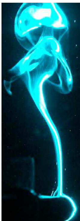
Fig. 1 : Mushroom-like vortex above a heated horizontal cylinder

Received 9 February 2009 and Revised 30 March 2009